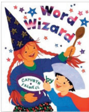
Word Wizard by Cathryn Falwell

You will need scissors, paper, glue and old newspapers or magazines.